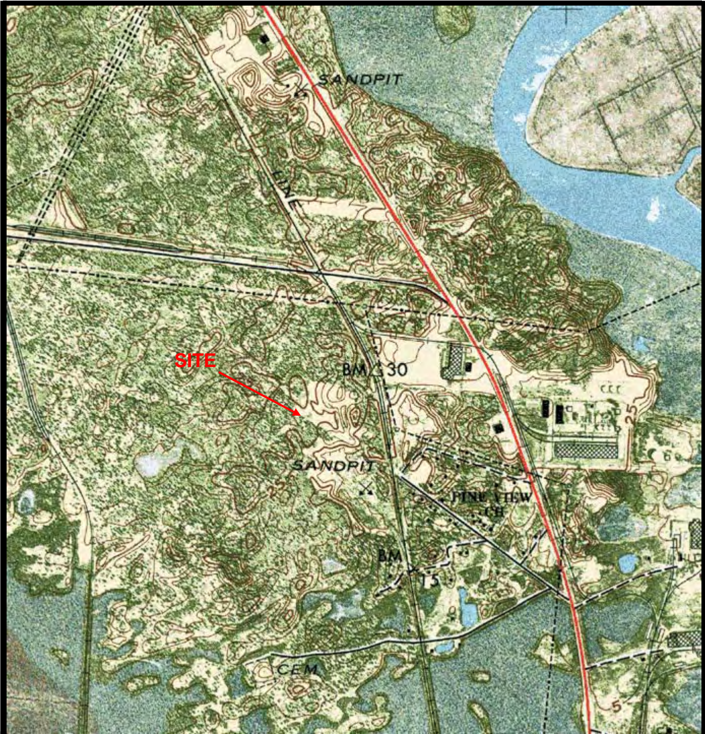
FIGURE 1: TOPOGRAPHIC MAP